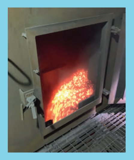
The Aumund steel plate conveyor type KZB-H will transport iron ore pellets at up to 750°C to the cooler.

Designed for hot material up to 1,000°C, the new conveyor is 92m long and 1,000 mm wide. It will replace the existing belt conveyor — which previously had to have its belts changed approximately every 40 days — in spring this year.